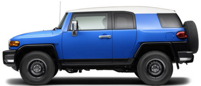
4x4 6-Speed Manual (4703) MSRP* Starting At: $22,890.00